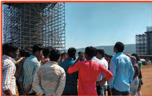
T.Y Civil Students visited Cable Stay Bridge, Raigad on 08 th January 2017