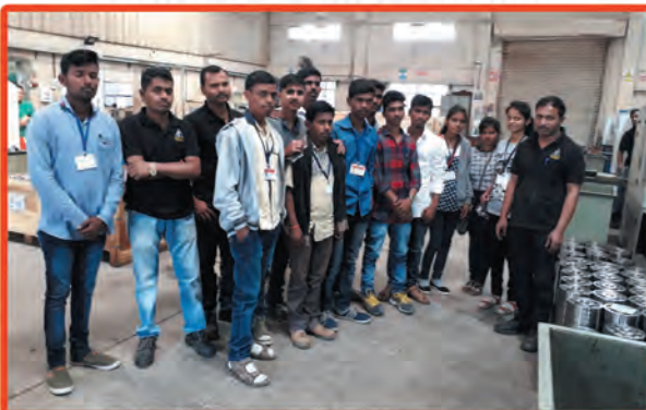
Electronics & Telecom. Students Visited Chaitanya Industries, Pune on 09 th February 2017