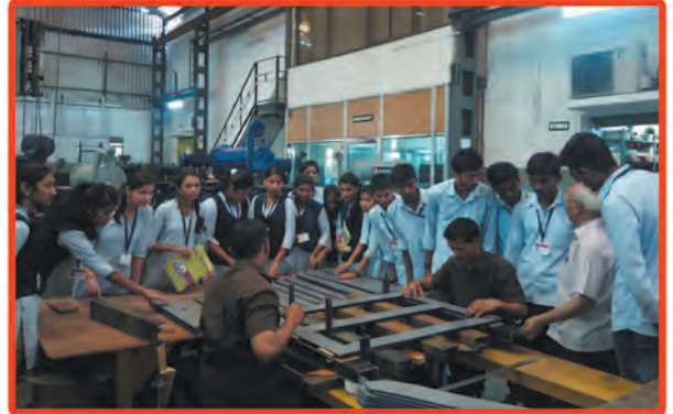
S.Y Electrical Students visited Power Engineers, Kolhapur on 02 nd February 2017