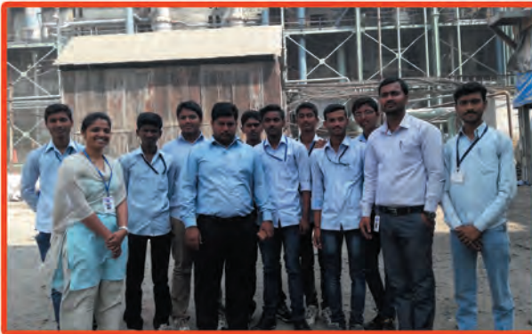
S.Y Mechanical Students visited Vishwas Sugar Factory, Shirala on 24 th January 2017