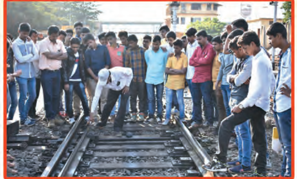
S.Y Civil Students visited Railway Station, Ratnagiri on 06 th February 2017