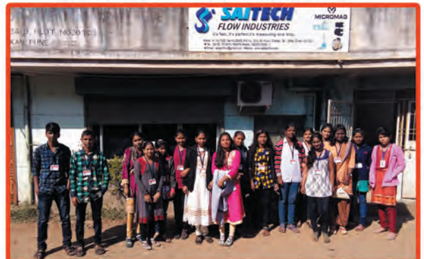
Electronics & Telecom. Students visited SAITECH Industries, Pune on 09 th February 2017