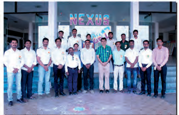
Department of Mechanical Engineering

Department of Mechanical Engineering Organised State Level Technical Event NEXUS' 17 on 16 th February, 2017. Students from Technical Institutes were participated in this event.