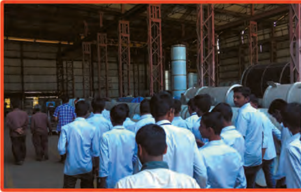
S.Y Mechanical Students visited S.P.V. Industry, Kolhapur on 22 nd February 2017