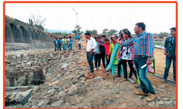
T.Y Civil Students visited Sawitri Bridge, Mahad on 09 th January 2017