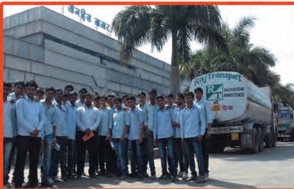
S.Y Electrical Students visited Sonhira Sugar Factory, Wangi on 24 th January 2017