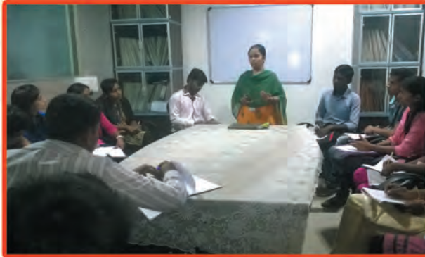
Computer Department students visited Biyani Technologies, Kolhapur on 04 th February 2017