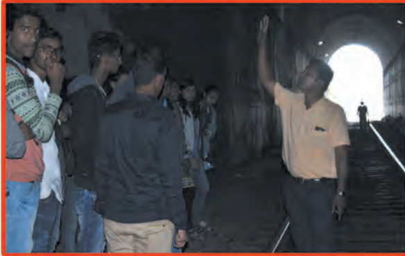
S.Y Civil Students visited Panval Viaduct, Ratnagiri on 06 th February 2017