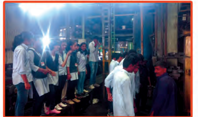
Mechanical Students visited Kasturi Foundry, Ashta on 10 th February 2017