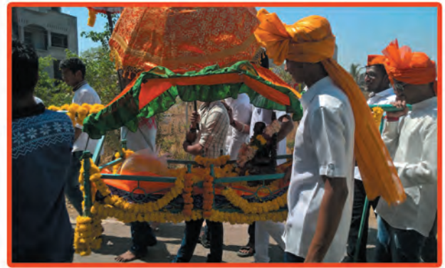
Celebration of “Shivajayanti” on 19 th February, 2017 at N.M.P.I Peth