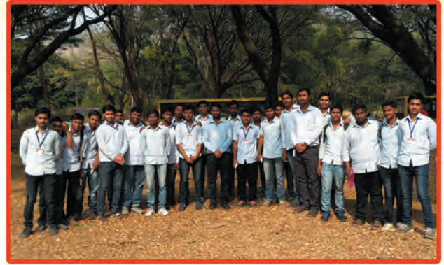
T.Y Mechanical Students visited Chandoli Dam on 17 th January 2017