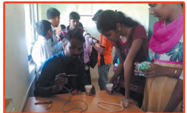
LED BULB Manufacturing Workshop by I-Smart Company on 27 th January,2017